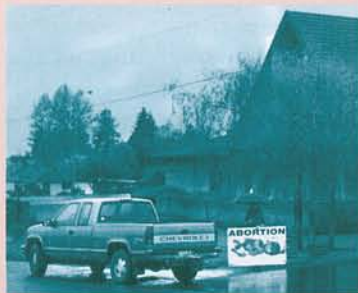
◀ The neighbor across the street parked his pickup here to block the view of the sign from his house. He said he disagreed with their message, but agreed with their right to protest. He just didn't want to have to look at the signs. He and a woman got into the truck a little while later and drove away.